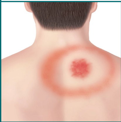
Bull's eye rash on the back.